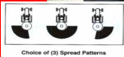
Choice of (3) Spread Patterns